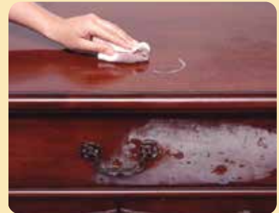
Eliminate white heat rings, water marks, sun fade, oxidation, smoke damage, etc.

Available In: Neutral, Maple-Pine, Golden Oak, Walnut, Cherry, Mahogany, Dark Walnut, Dark Oak, and Ebony Brown